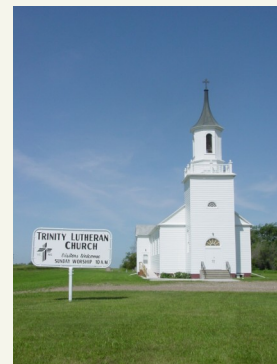
Trinity Lutheran Church in rural Hazen, ND

The congregations continue in many of their individual activities, but they now also come together for some joint activities, such as