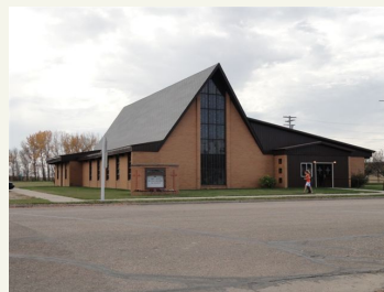
St. John's Lutheran Church at McClusky, ND