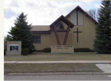
St. John Lutheran Church in Underwood, ND