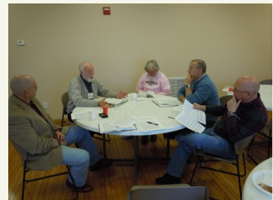
Discussing rural outreach at RSTM in Concordia, MO with other rural leaders.