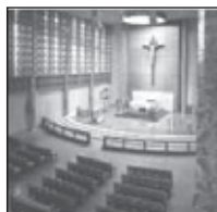
Concordia Univ. Wisconsin Chapel

Today we travel to Concordia University St. Paul, the alma mater of the District President and his wife. The North Dakota District has students attending this Lutheran University as well. It is worth mentioning here that the North Dakota District LWML provides an annual grant of $35,000, which goes toward tuition assistance of our Lutheran Church Worker students. What a blessing!