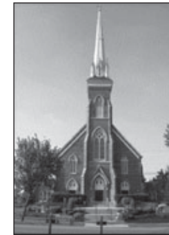
St. Lorenz, Frankenmuth